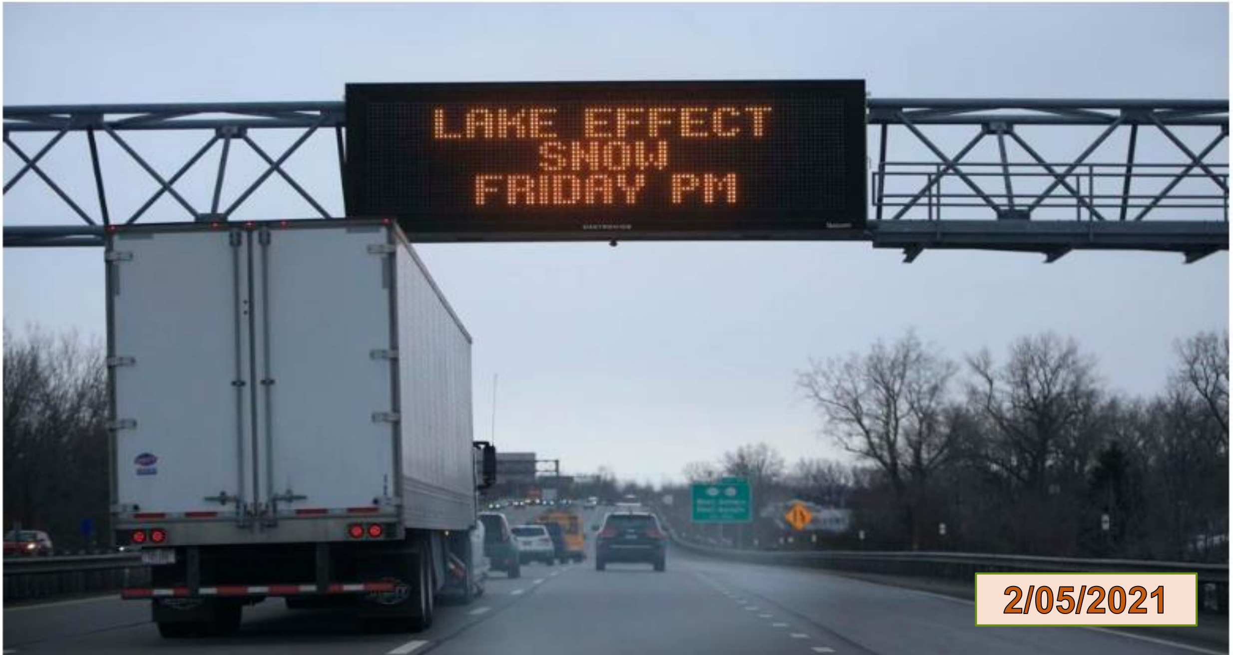
A sign on the Thruway warns of lake-effect snow on Friday, Feb. 5, 2021.